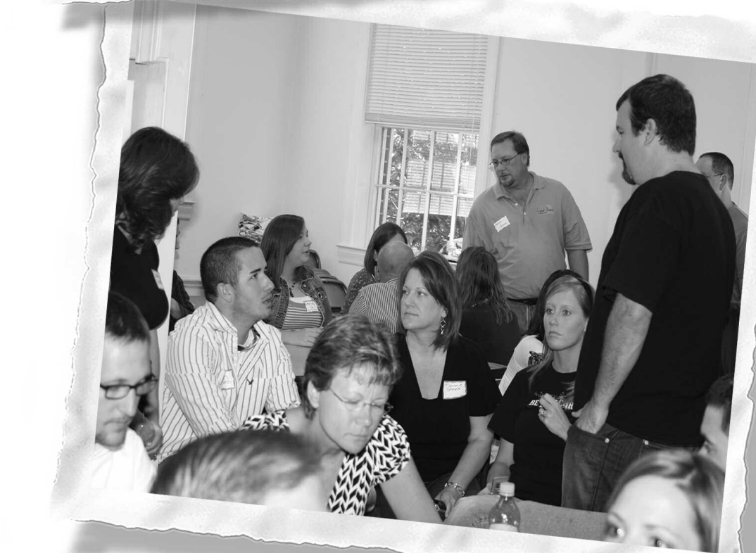
ABOVE PHOTOS: TOP - Caption goes here BOTTOM - Caption goes here. Caption goes here